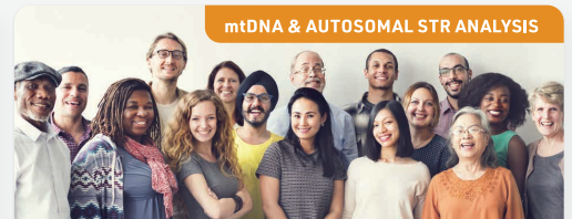
mtDNA & AUTOSOMAL STR ANALYSIS

Trace the migration pattern of your ancient ancestors 100,000 years ago as they migrated out of Africa and settled around the World.